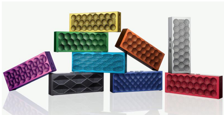
Fig4. In these speakers, texture is applied for functional reasons