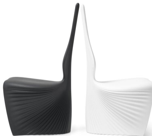
Fig2. Designed by RosLovegrove, use of texture intensifies the form [source: www.designboom.com]