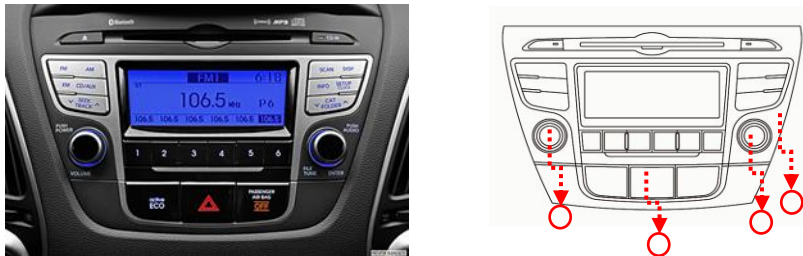
Fig11. Priority of applied texture on car console