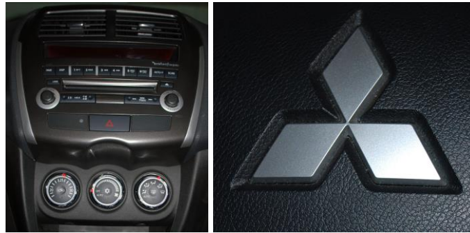
Fig9. ASX Console and knobs