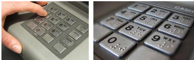
Fig1. Texture applied to ATM for blind person

• Another reason in choosing texture patterns for a product is given personality to it. Deciding on a texture pattern for a product can be carried out in a way that attributes the product to a particular group of people or reminds a specific lifestyle (Figure 2-4).