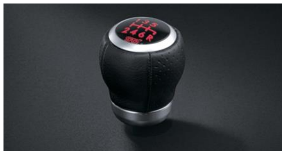
Fig6. Applying texture on interior components decreases glossiness, which leads to a vivid vision when looking at the buttons